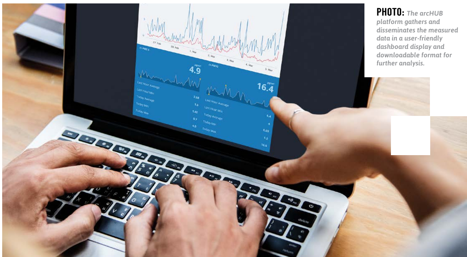
PHOTO: The archHUB platform gathers and disseminates the measured data in a user-friendly dashboard display and downloadable format for further analysis.