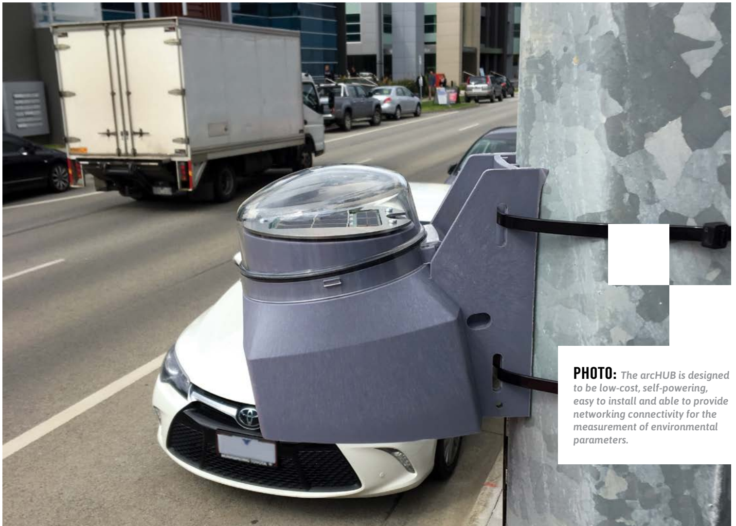
PHOTO: The archHUB is designed to be low-cost, self-powering, easy to install and able to provide networking connectivity for the measurement of environmental parameters.