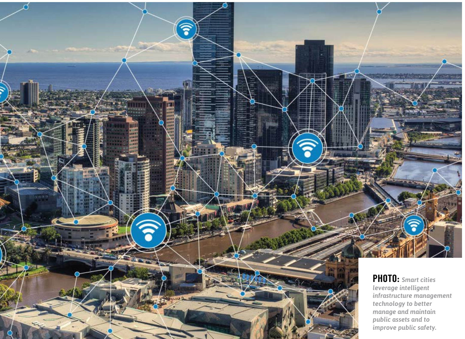
PHOTO: Smart cities leverage intelligent infrastructure management technology to better manage and maintain public assets and to improve public safety.