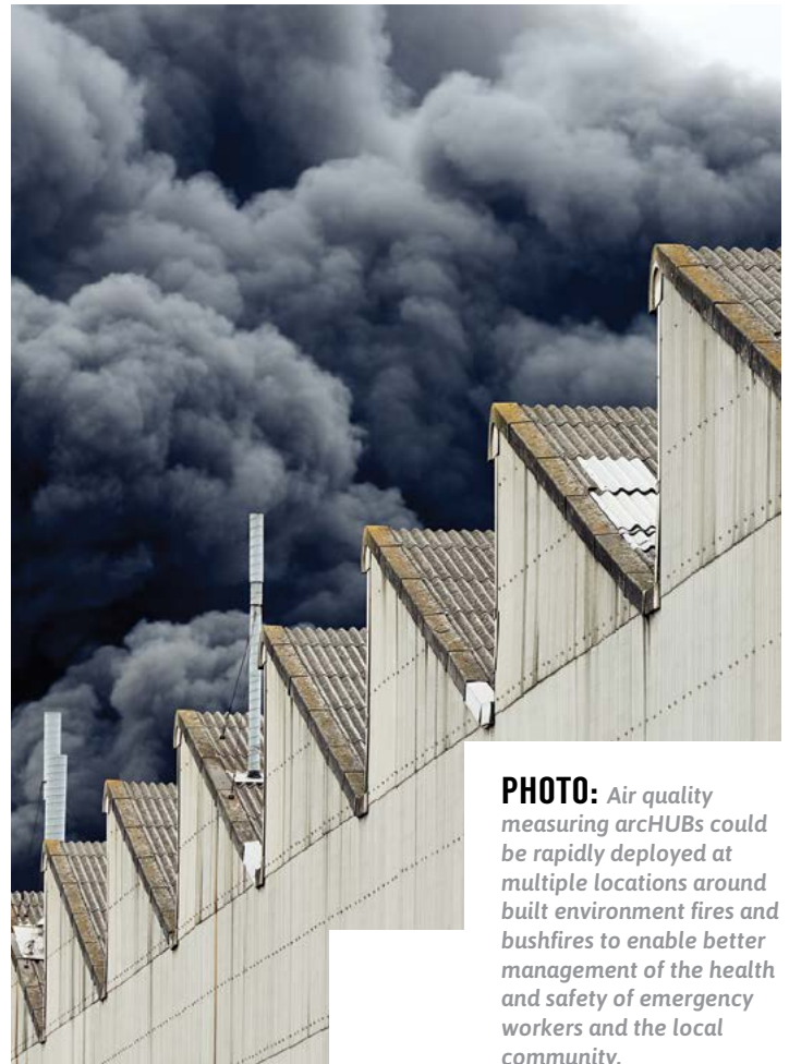
PHOTO: Air quality measuring archHUBs could be rapidly deployed at multiple locations around built environment fires and bushfires to enable better management of the health and safety of emergency workers and the local community.

"I hope the St Joseph's program serves as an example for other schools and school communities. Ideally I would like all schools to take up this very simple and inexpensive measure to monitor air quality and ensure that students are safe at all times."